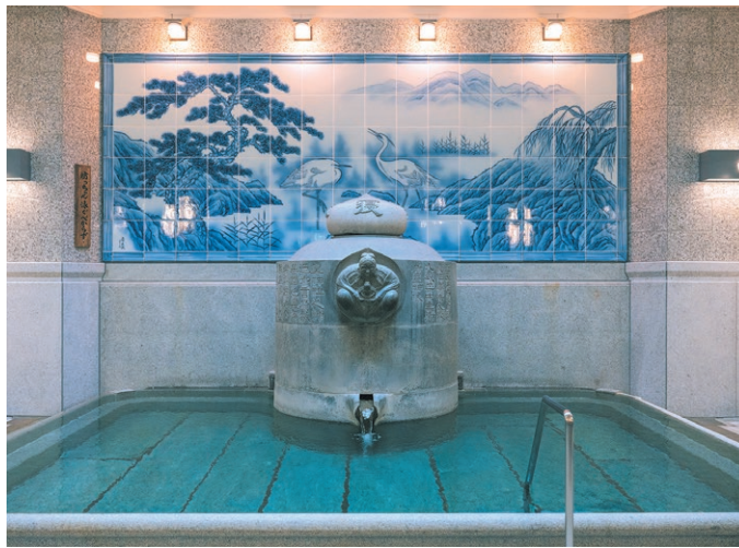
2 #dogoosenhonkan Kami-no-Yu Men's bathing room