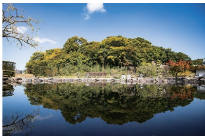
2 #dogokoenpark A hill reflected on the inner moat