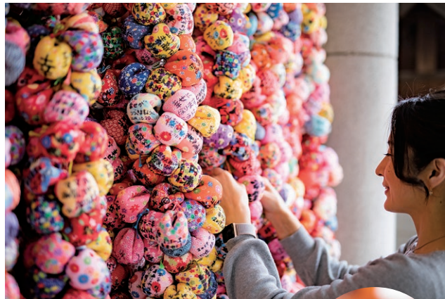
4 #enmanjitemple Hugely popular among young women as being a spiritual power spot for making romantic relationship wishes come true