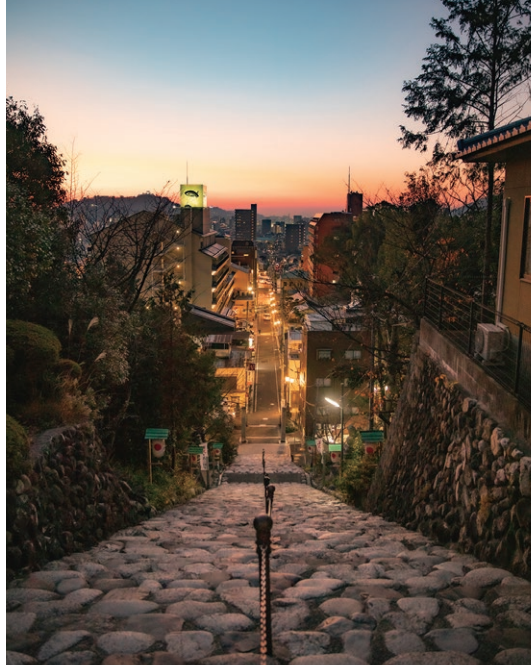
7 #isaniwajinjashrine View that makes you glad you came!