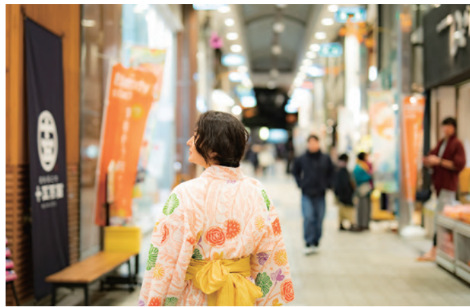
2 #dogoshoppingarcade Rows of shops, from trendy ones to nostalgic ones