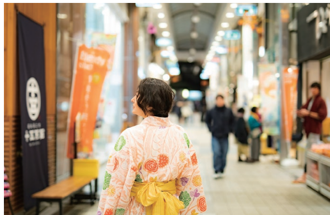
2 #dogoshoppingarcade Rows of shops, from trendy ones to nostalgic ones