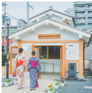
1 #no4hotspringsupplyfacility You can see hot spring water being collected from wells