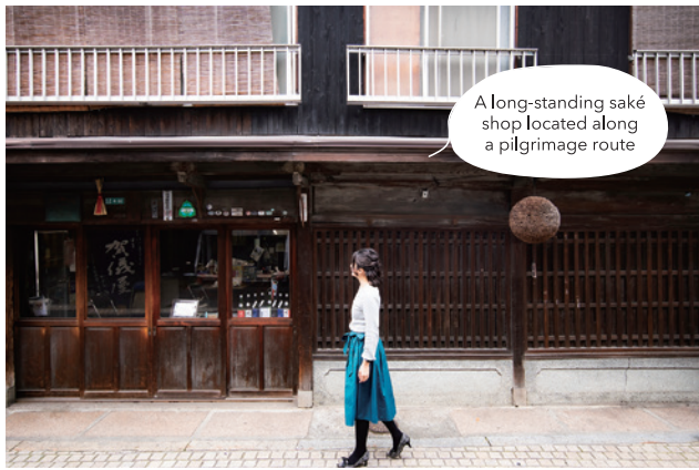
A long-standing saké shop located along a pilgrimage route