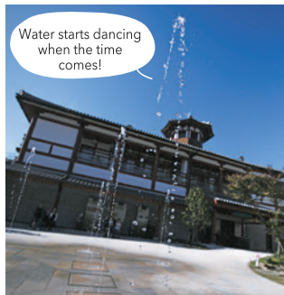
3 #asukanoyu A water fountain show you can see in the inner courtyard