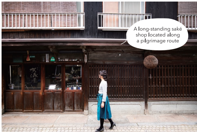
A long-standing saké shop located along a pilgrimage route