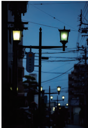
2 #nikitatsunomichi Passing by a beauty parlor and produce shop, the night has a sense of the everyday life and conjures nostalgia