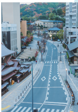
3 #shirasagizakaslope The area is lined with hot spring inns and hotels