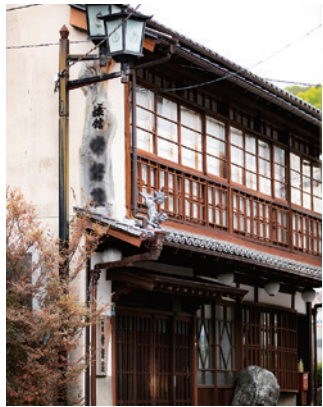
#ryokan #uchiyu (Tokiwasō)

Uchiyu is a hot spring bath at an inn in a hot spring district. In Dōgo, the first uchiyu was made in 1956