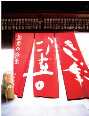
#minakuchishuzo A long-standing brewery that makes sake and microbrew beer