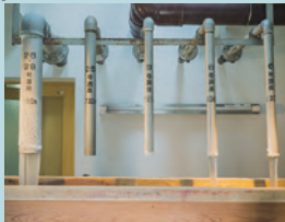
1 No.4 Hot Spring Supply Facility

Water is pumped from 18 hot spring sources of varying temperatures, collected and blended at four hot spring supply facilities, and after the temperature is adjusted, sent to public bathhouses and hotels. It is natural hot spring water to which no heat or water has been added. Guests can enjoy fresh hot water that comes directly from the spring.