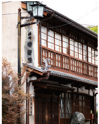
#ryokan #uchiyu (Tokiwasō)

A water fountain show you can see in the inner courtyard